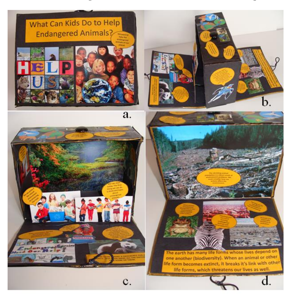
Appendix 1-a Instructor's Pop-up Box Showing Problems Related to Endangered Animals and What Kids Can Do to Help