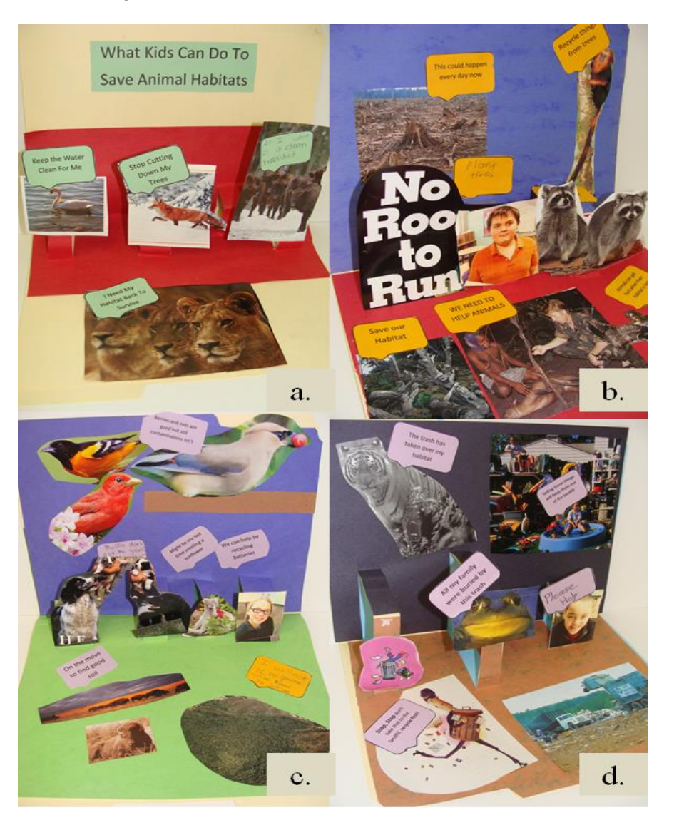
Figure 3 Interior Scenes of Student Pop-up Constructions Concerning Animal Habitats

3b chose negative images from around the world to illustrate his point. He crowded the images around the words "No Room to Run" to show how animals are losing their habitats. The student who made the display in 3c took appealing images and used contrast to make her point. The work of a final student is shown in 3d. He used humour and a mixture of photographs and cartoons to make his work interesting.